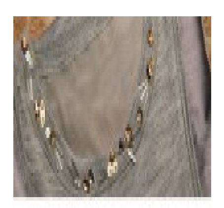
Embellished Simplicity Tutorial